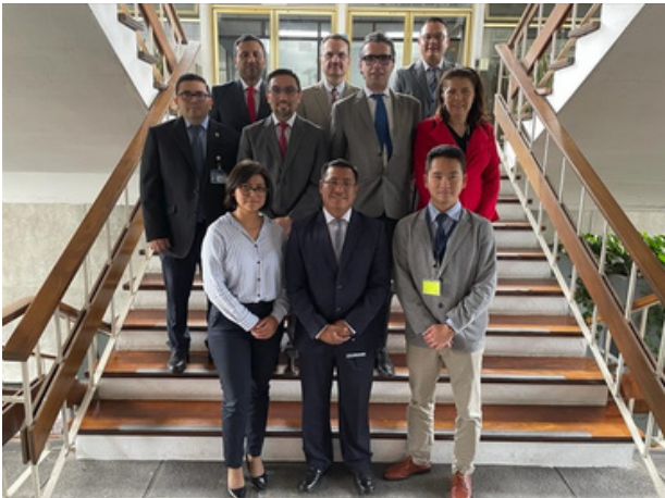
Mission of technical assistance with the Bank of Guatemala on liquidity forecasting using the statistical framework developed by MCM in June 2023.

During the present phase (2019-25), CAPTAC-DR has so far carried out three bilateral technical assistances to introduce the MCM framework described above. In terms of training, during the pandemic, a virtual workshop was conducted. In addition, the Center will hold in January 2024 an in-person workshop on liquidity forecasting with the region’s central banks operating OMOs. The purpose of these activities is to continue the introduction or use of the statistical tools contained in this framework, and for central bank officials to develop their estimation capabilities.