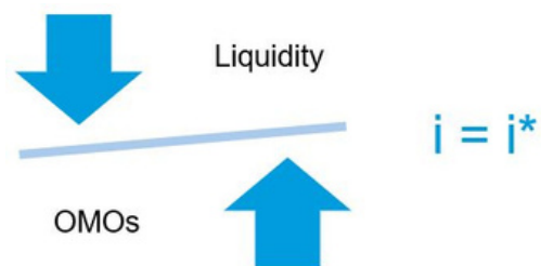
Graph 1: Calibration of OMOs

In any case, the central bank needs to forecast the level of liquidity (understood as the balance of banks’ accounts at the central bank) initially to attempt to achieve this balance through OMOs.