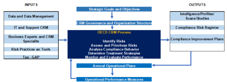
Figure 1: Conceptual Framework for Tax Compliance Risk Management