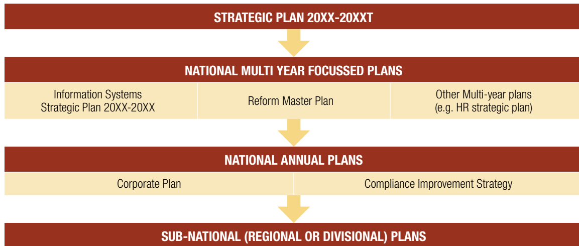
Figure 1. Hierarchy of Planning Documents

organization, such as the compliance plan or operations plan which will highlight particular IT needs for their purposes. Figure 1 shows the hierarchy of planning documents.