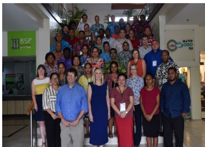
Nadi, December 2018

and measuring gross domestic product (GDP) by expenditure.