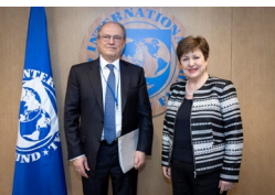
H.E. Deputy Prime Minister Saade Chami of the Lebanese Delegation met with the Managing Director during the 2022 IMF Spring Meetings