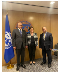
H.E. Central Bank Governor Amer and H.E. Minister of Finance Maait of the Egyptian Delegation met with the Managing Director and Dr. Mohieldin during the 2022 IMF Spring Meetings