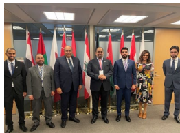
H.E. Sh. Salman Bin Khalifa Al Khalifa, The Minister of Finance and National Economy of Bahrain met with Dr. Mohieldin during the 2022 IMF-WB Spring Meetings