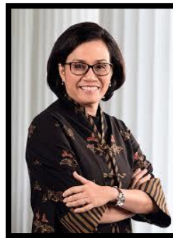
H.E. SRI MULYANI INDRAWATI Minister of Finance, Indonesia

Moderated by BABAK ABBASZADEH , President and CEO, Toronto Centre